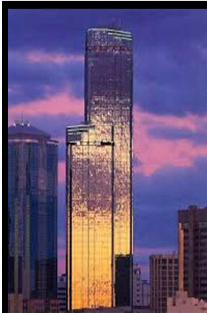
Rialto Building at Dusk

Job Value: $7.2M Client: Rialto Project Manager: Built Vic Pty Ltd