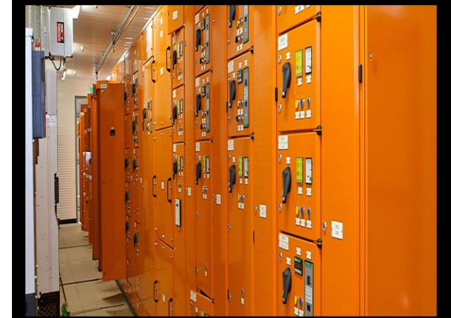
Rialto Part MSB