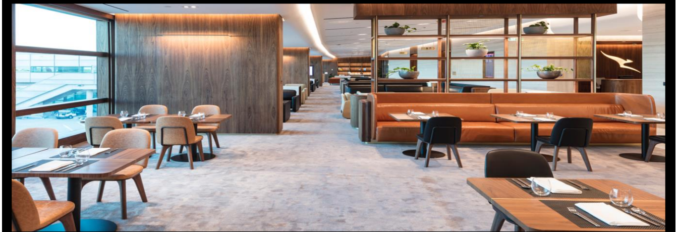
Qantas Domestic Lounge