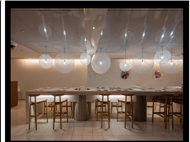
Decorative Lighting Space